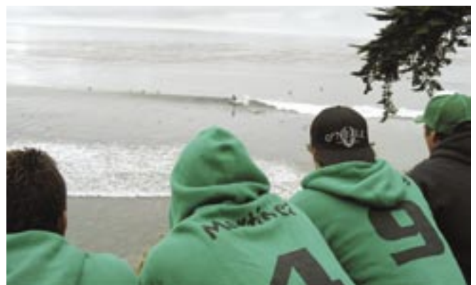
Quiksilver California Cup Series, Steamer Lane in Santa Cruz

For more information on the National Surf League and the 2005 Quiksilver California Cup, go to www.nslgame.com .